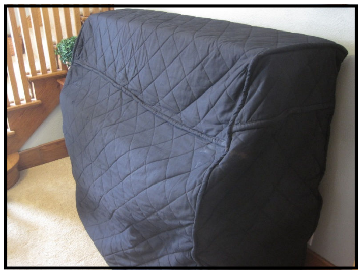
A heavy padded cover protects the best.

For providing effective protection, an unpadded or padded piano cover may be the ideal solution—a way to take away the appeal of keys to bang on, while at the same time cushioning any unsupervised activity to protect the finish, keys and action.