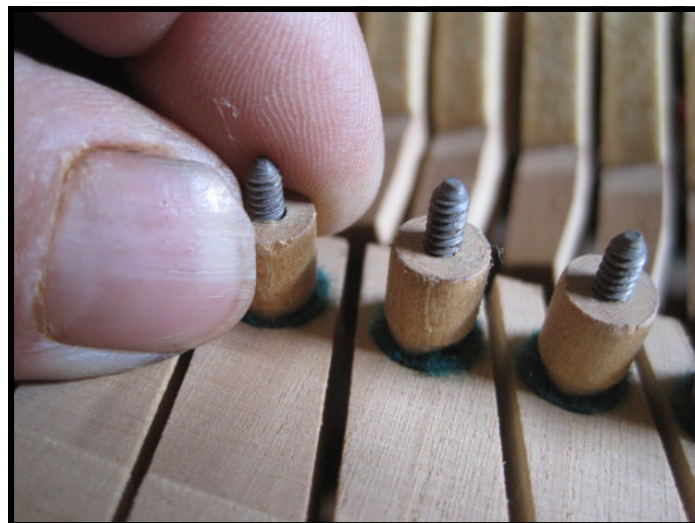
Adjusting lost motion with a fine touch.

At present, your piano is in need of adjustment as far as lost motion is concerned. Having the adjustment set correctly would improve the consistency of the touch of your instrument.