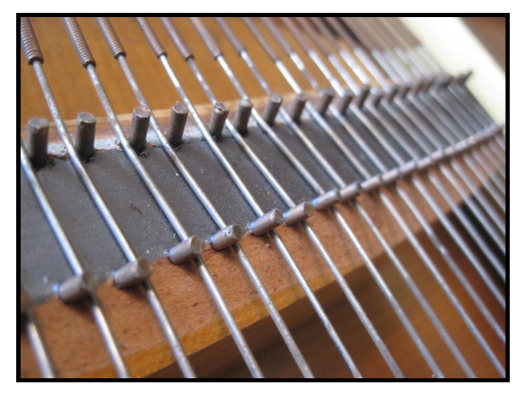
Bill Davis, RPT The Piano Place GA Appts: http://bit.ly/2G4ICDJ

After the holes are drilled and the pins replaced in the bridge, the bass strings are put back in place and brought up to tension. The end result is a much more reliable sound to the bass, without the annoyance of the buzzes and rattles that loose bridge pins tend to cause.