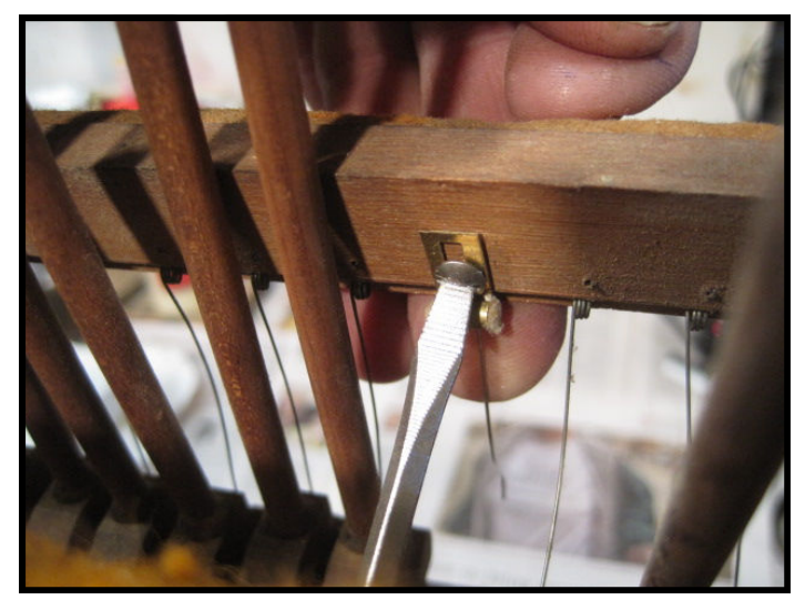
A hammer butt repair spring being installed.

For an on-the-spot replacement, a hammer butt repair spring may be used to replace a broken spring. The repair spring has a brass clip that may be screwed onto the hammer spring rail, as shown in the photo at the top of the next column.