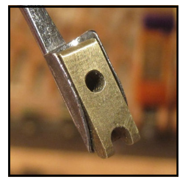
Replacement butt plate

When a butt plate breaks, the break is nearly always in line with the threaded hole which is intended for a machine screw to affix the butt plate to a tongue of the brass rail.