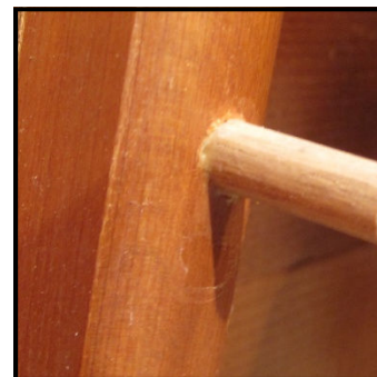
Dowel inserted in place.

In order to install toggles, 1/4" holes are drilled through the rib and soundboard at regular intervals from one end of the separation to the other. Woodworking glue is then worked into the space between the rib and the soundboard so that when the toggles are inserted and tightened down, the clamping action of the toggles produces a tight bond.