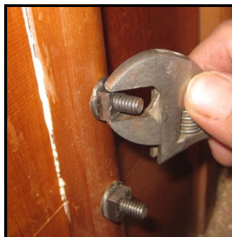
Toggle being tightened

One effective method of fixing the problem is to insert soundboard toggles to serve as clamps so that the ribs may be properly reglued to the soundboard. This repair may be accomplished on site, although more than one visit will be required to allow time for the process to be performed. The ribs of your piano are loose or separating from the soundboard and need to be repaired in order for the piano to sound its best.