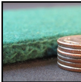
Back rail cloth

As the keybed felts harden and wear thin the keys become uneven in height from note to note. Also the amount of downward stroke (key dip) begins to vary, resulting in an action which has an uneven touch. A perfectly level set of keys with a uniform amount of key dip is essential to a piano action which is performing up to its potential.