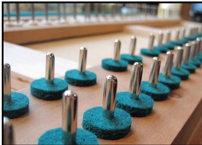
New set of keybed felts in place.

Keybed felts come in a range of thicknesses, so that the original size of the felt installed at the factory may be duplicated. Paper and card punchings as thin as .002" are used under the felts for final adjustments necessary for level keys and even key dip.