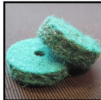
Front rail punchings

The felt used for backrail cloth, as well as the balance rail and front rail punchings, is a very thick, dense felt that is designed to stand up to decades of constant use.