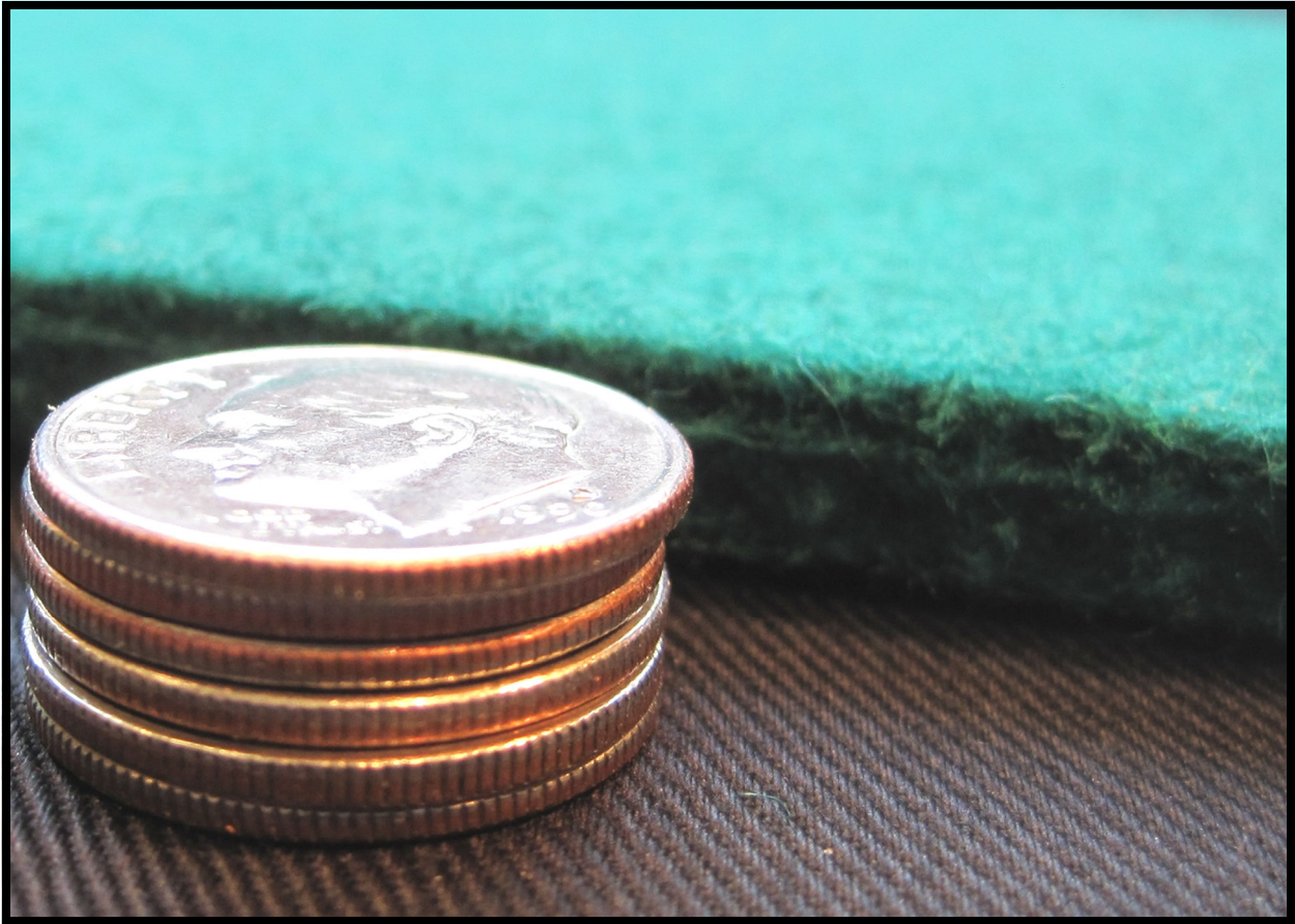
The thickness of heavy backrail cloth equals that of six dimes.

Very much so. As illustrated in the photo above, the felt used for backrail cloth (as well as balance rail and front rail punchings) is a very thick, dense felt that is designed to stand up to decades of constant use.