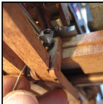
Hooked into place

To do this, the old damper springs are ordinarily clipped off at the base and a new set of springs are installed to take their place.