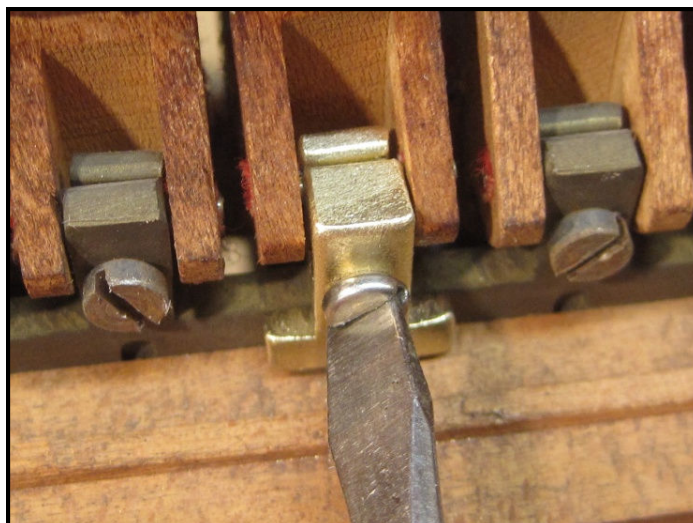
Repair clip for broken tongue being installed.

Individual butt plates may be replaced, but if more than a couple have broken the most practical repair may be to replace the complete set while the action is out of the piano. Once done this problem area will be taken care of for the foreseeable future.